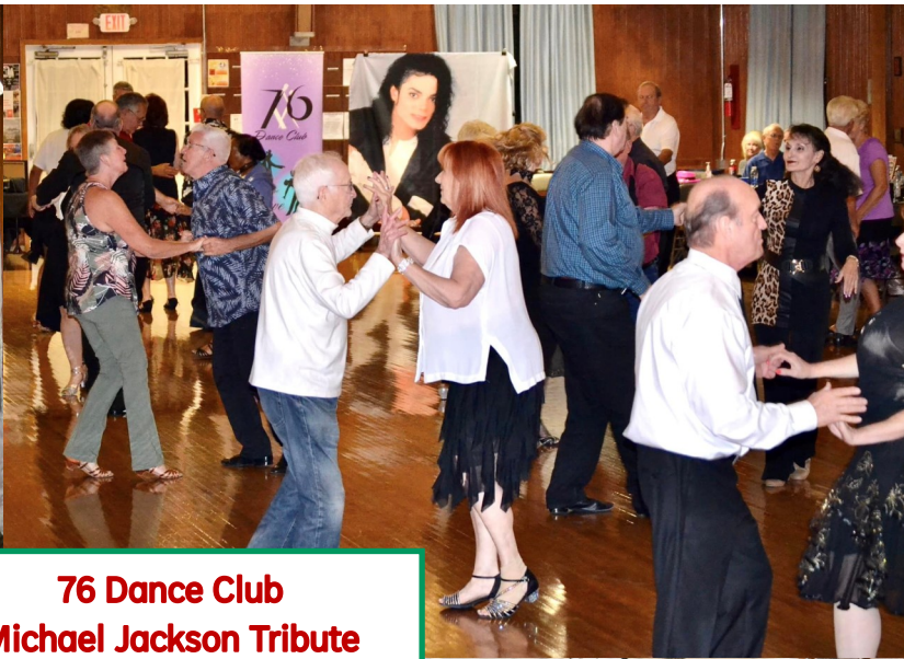
76 Dance Club Michael Jackson Tribute