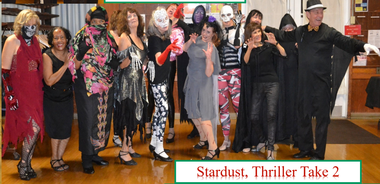
Stardust, Thriller Take 2